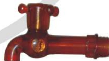
(Blue / Brown / Green)